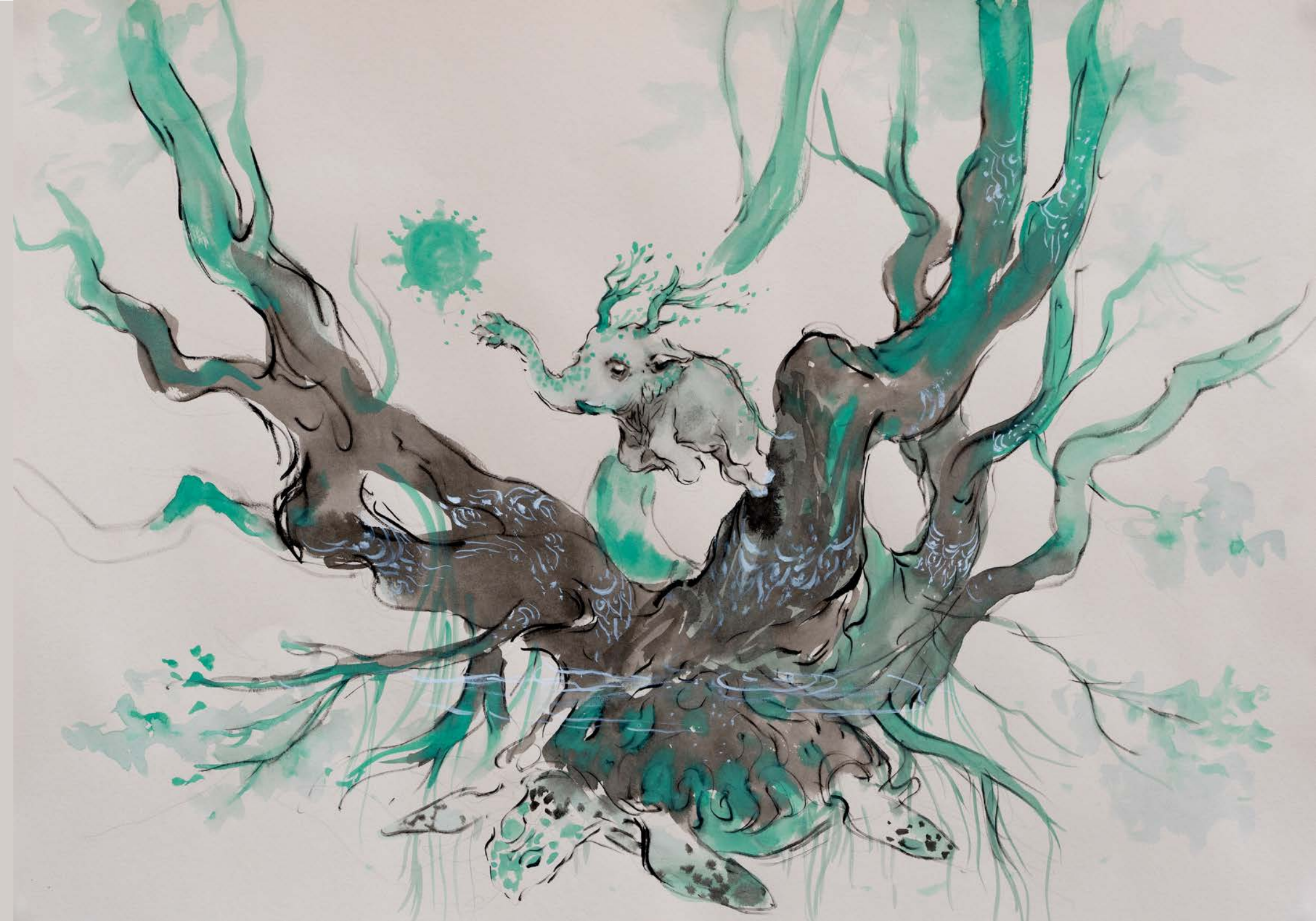
2322 Voyage to the wisdom sun, 2022 Ink & Gouache on paper, 19 x 27 inch