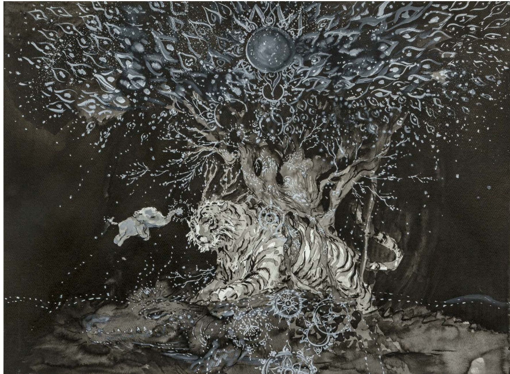
2304 Harmonics of Being , 2022 Ink & Gouache on paper, 22 x 30 inch