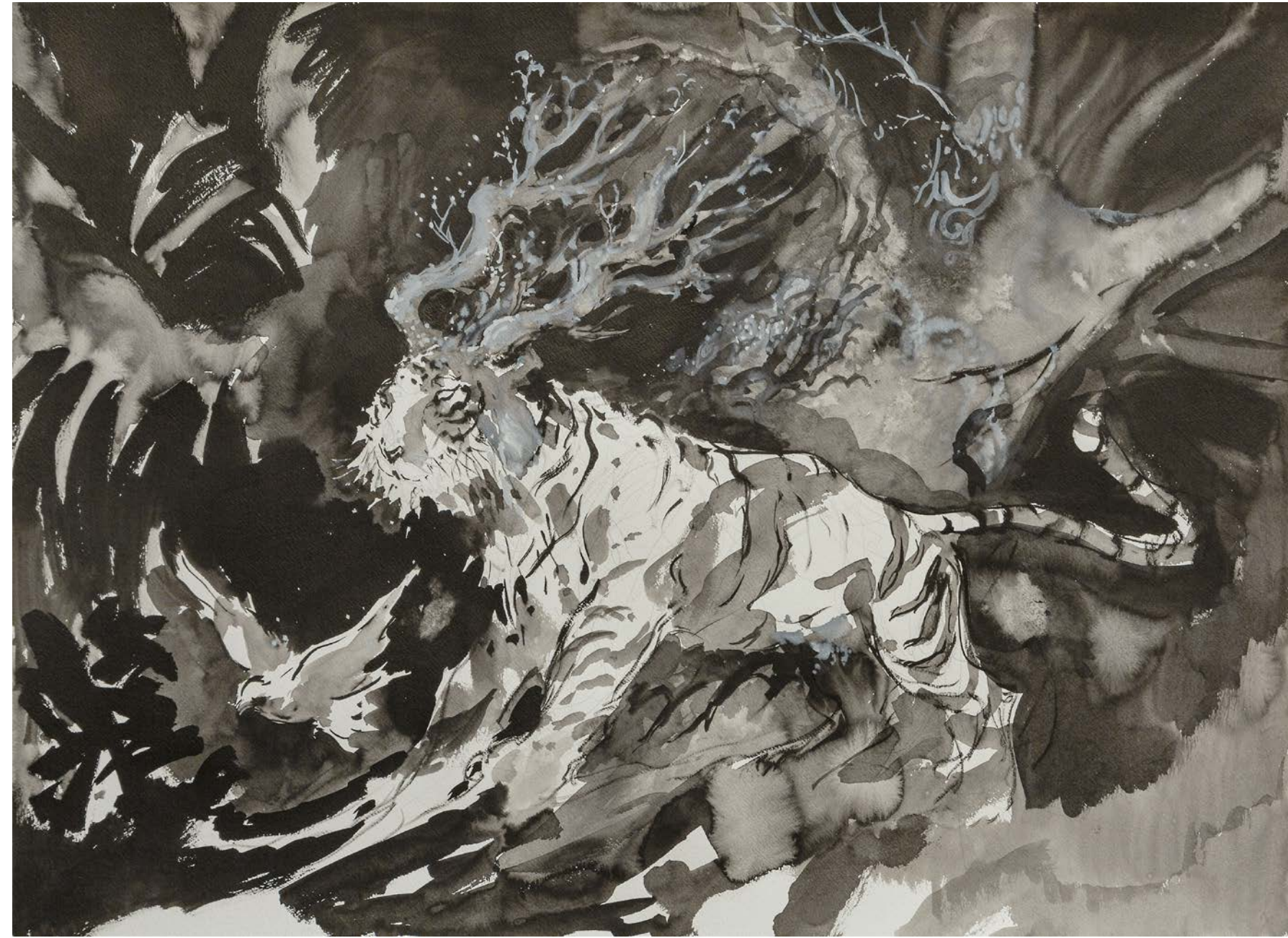
2312 Lunar Alchemist , 2022 Ink & Gouache on paper, 22 x 30 inch