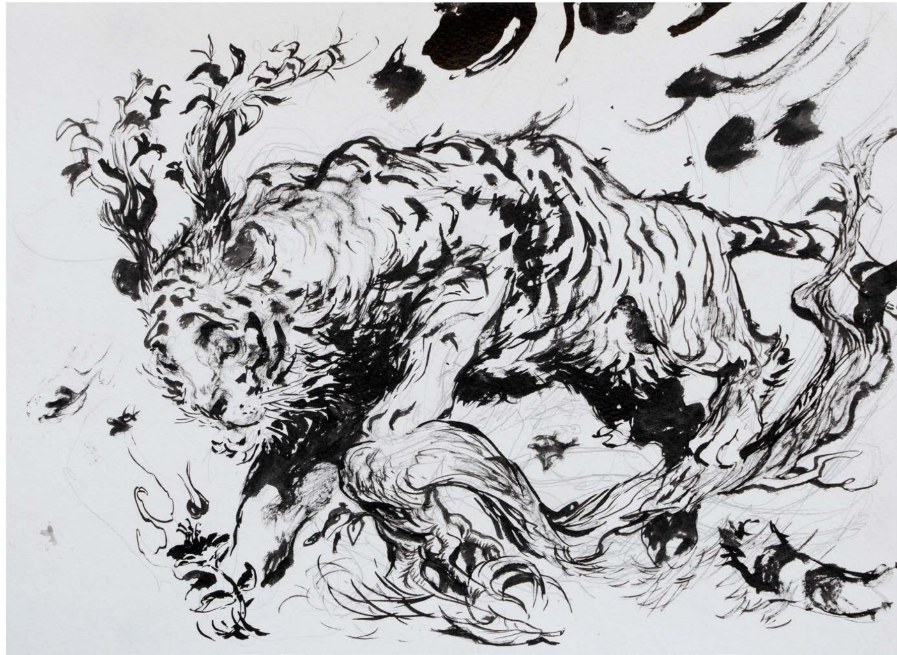
2333 Untitled , 2022 Ink on paper, 11 x 16 inch