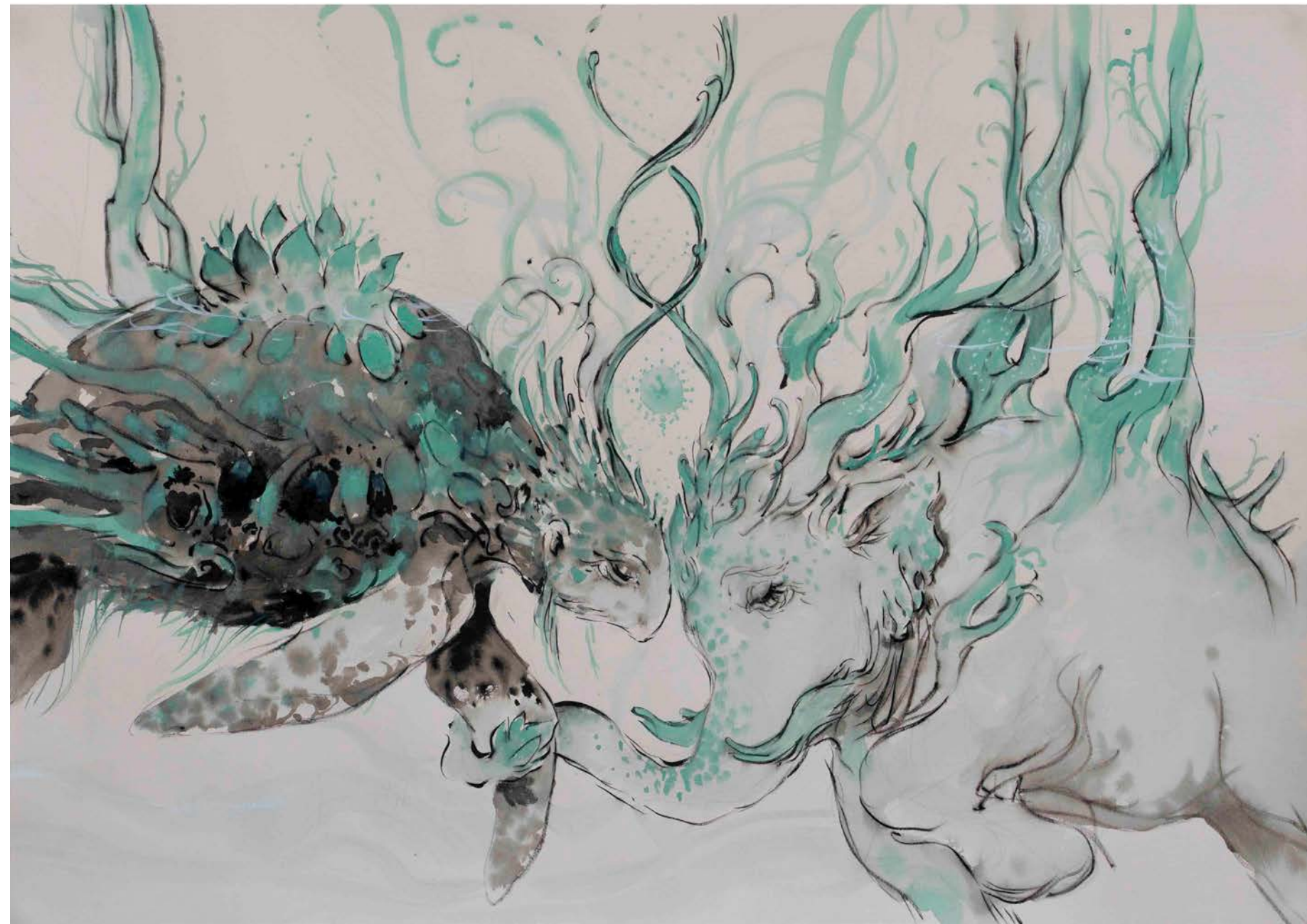
2321 A helical beginning , 2022 Ink & Gouache on paper, 19 x 27 inch