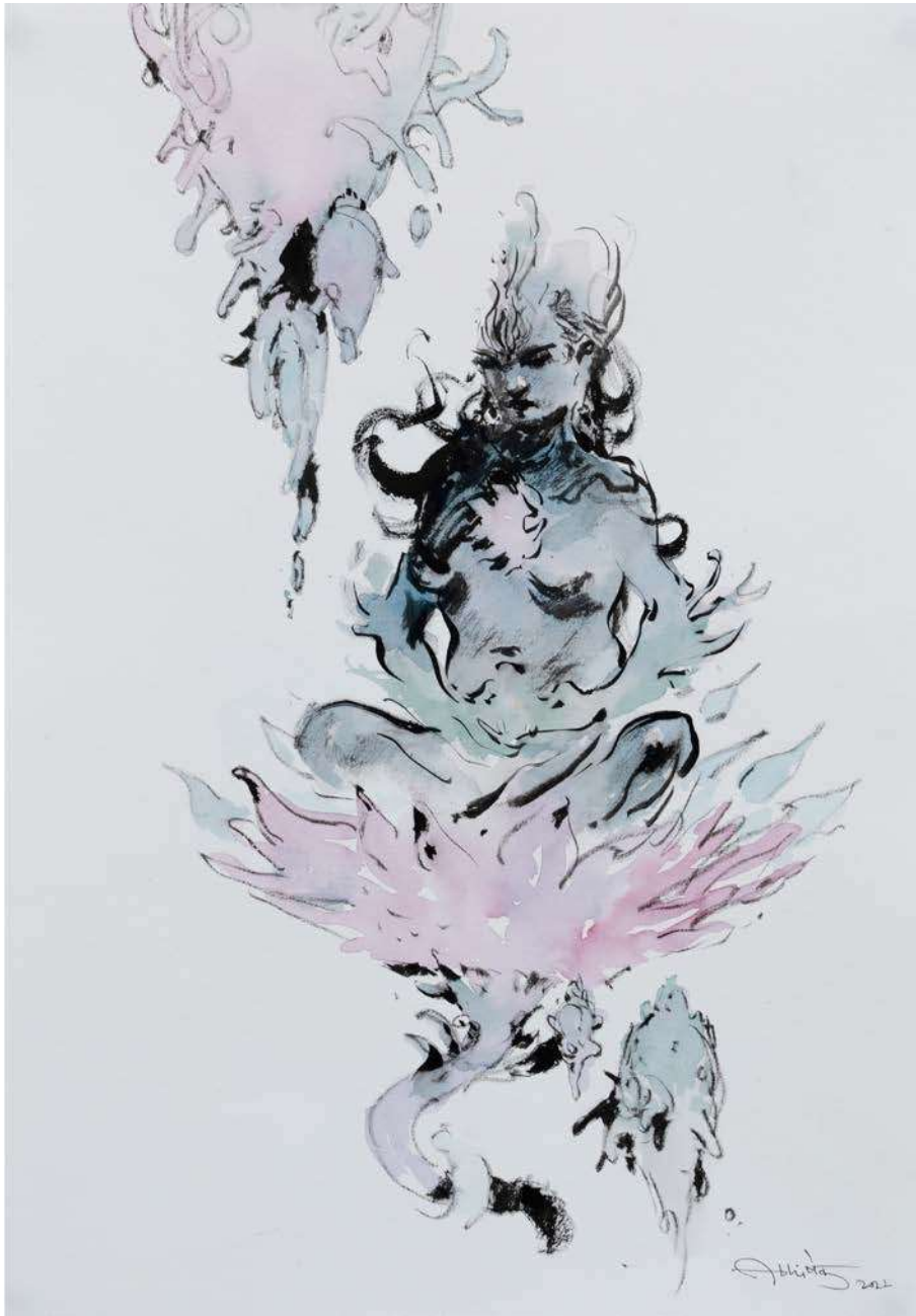
2325 Untitled , 2022 Ink & acrylic on paper, 11 x 16 inch