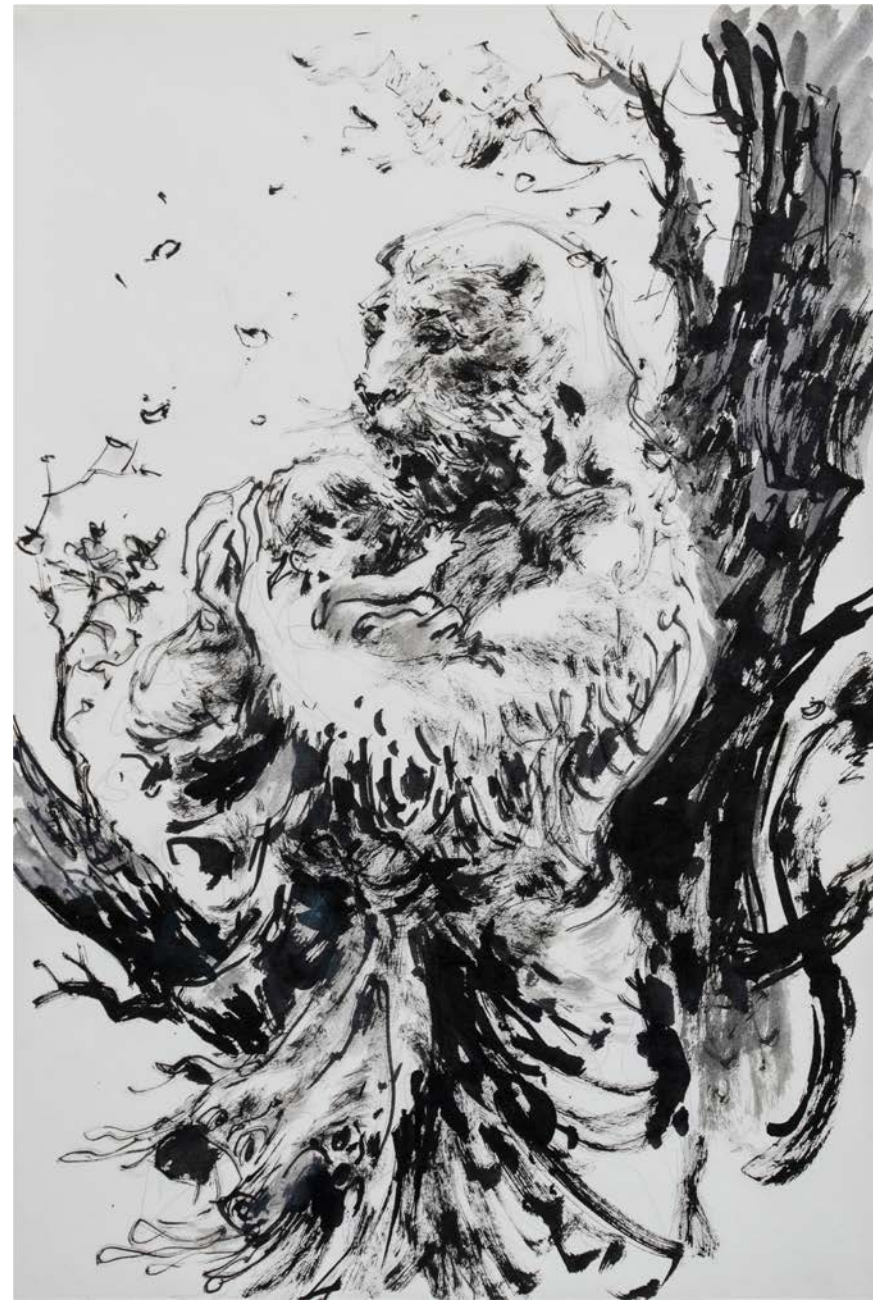
2329 Untitled , 2022 Ink on paper, 11 x 16 inch