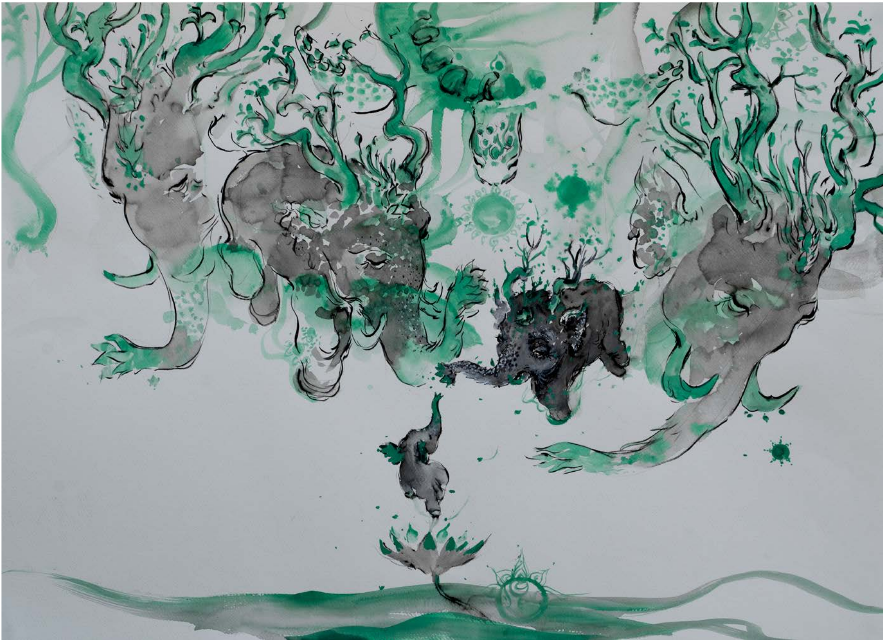
2320 The Healing River , 2022 Ink & Gouache on paper, 22 x 30 inch