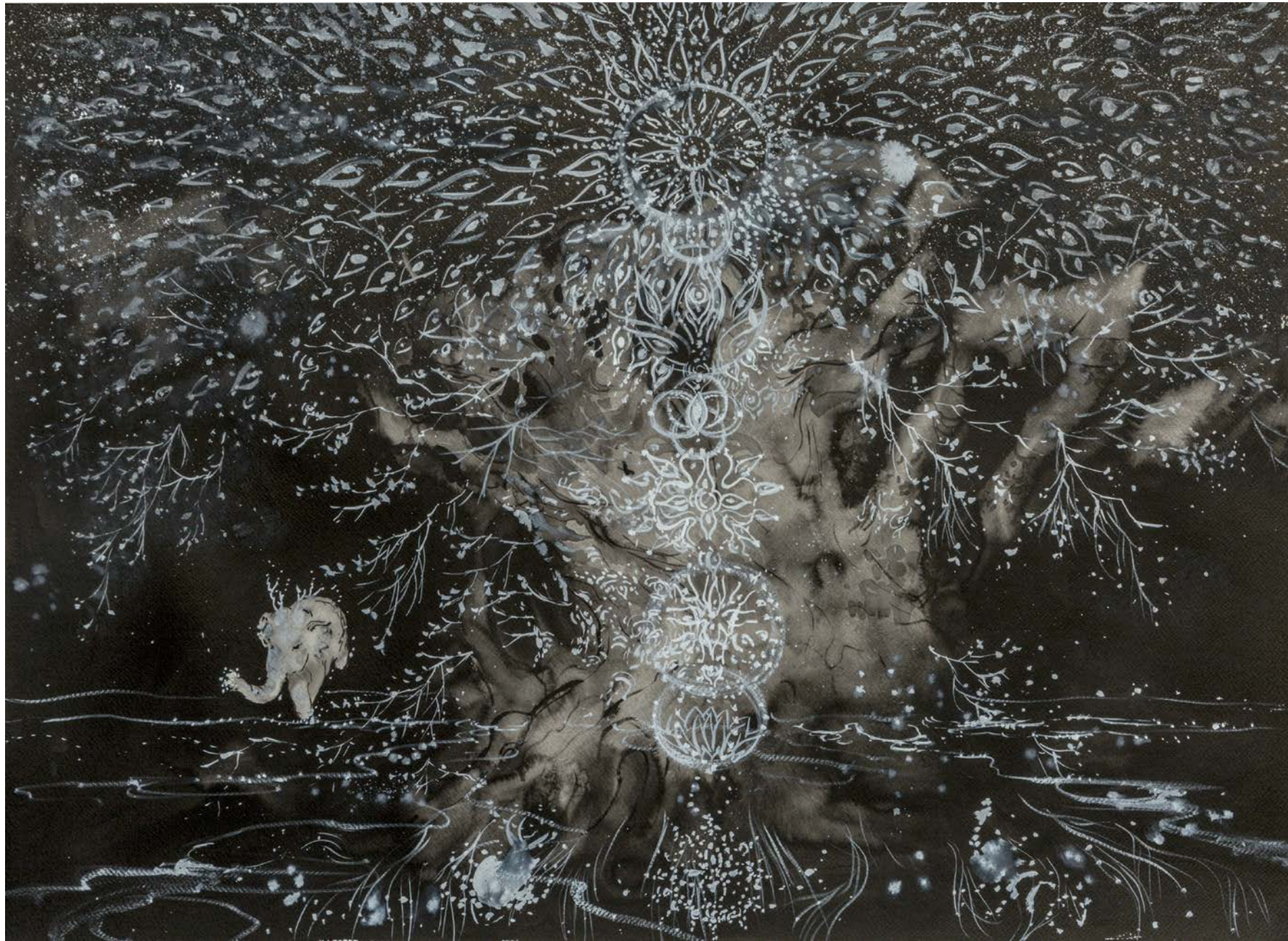
2302 Nuclei Weaver , 2022 Ink & Gouache on paper, 22 x 30 inch