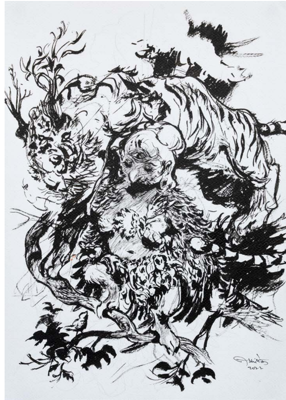
2331 Untitled , 2022 Ink on paper, 11 x 16 inch