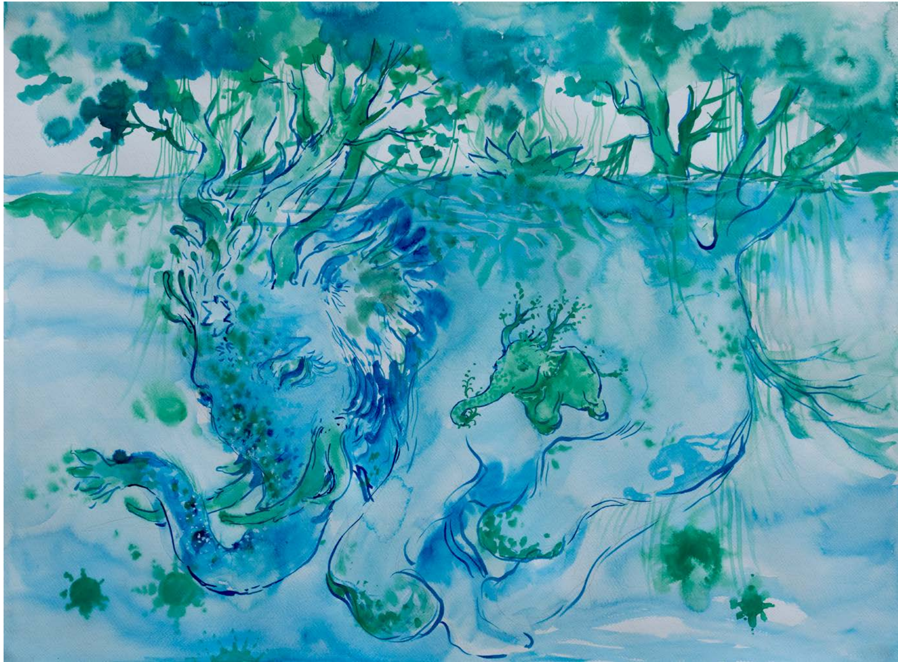
2323 Womb dreams , 2022 Ink & Gouache on paper, 22 x 30 inch