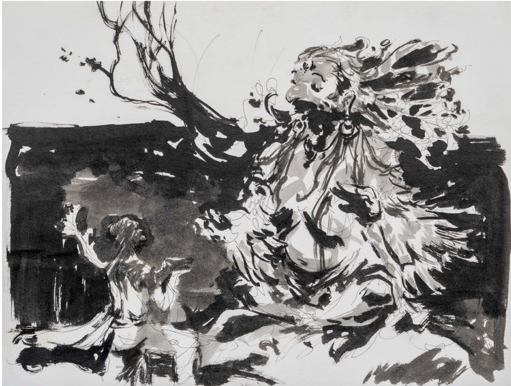
2332 Untitled , 2022 Ink on paper, 11 x 16 inch