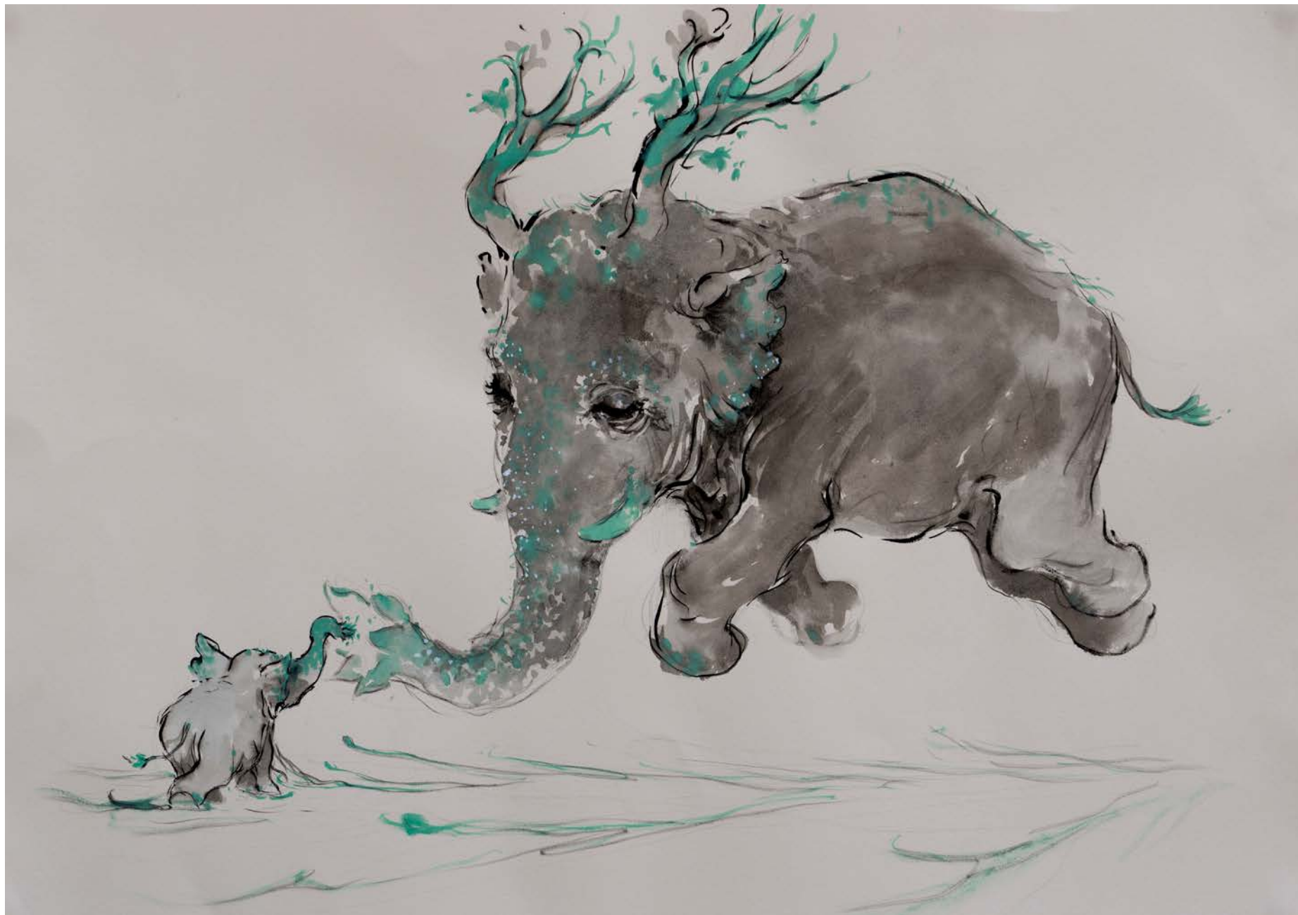
2319 Call of the Mother , 2022 Ink & Gouache on paper, 19 x 27 inch