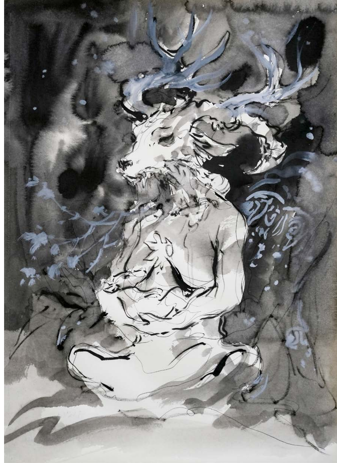
The Mother , 2022 Ink & Gouache on paper 12 x 16 inch