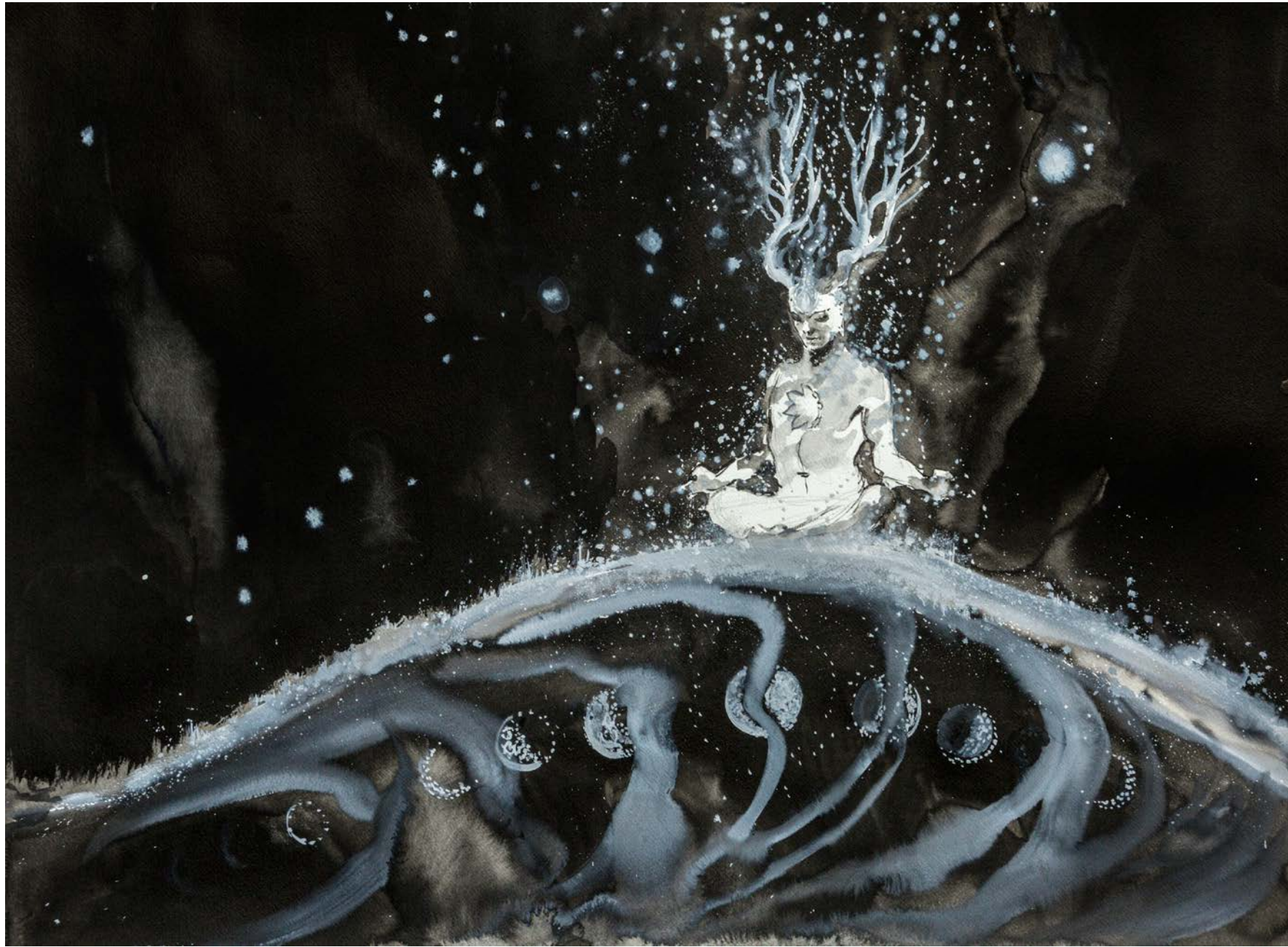
2311 Finding Anahata , 2022 Ink & Gouache on paper, 22 x 30 inch