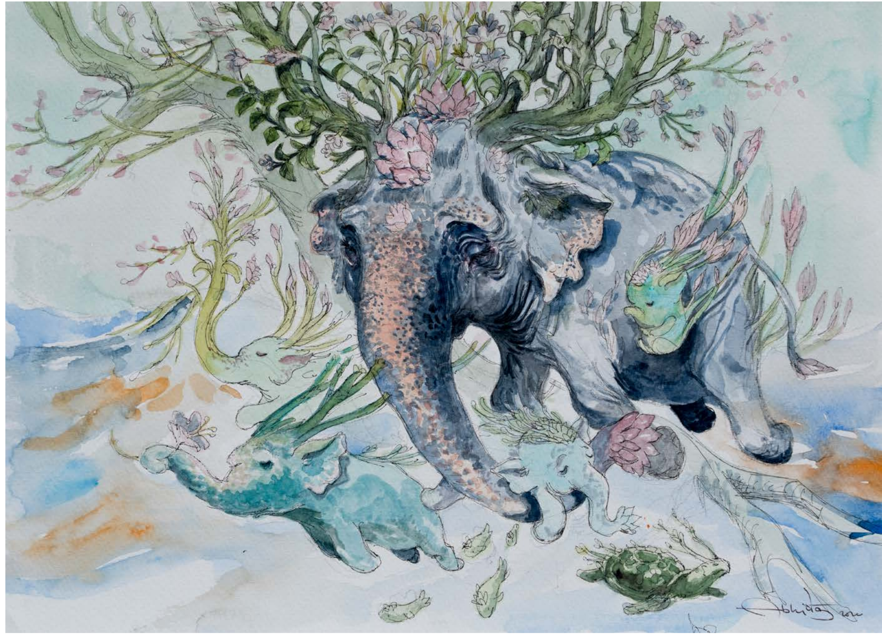
2334 Untitled , 2022 Water colour on paper, 11 x 16 inch