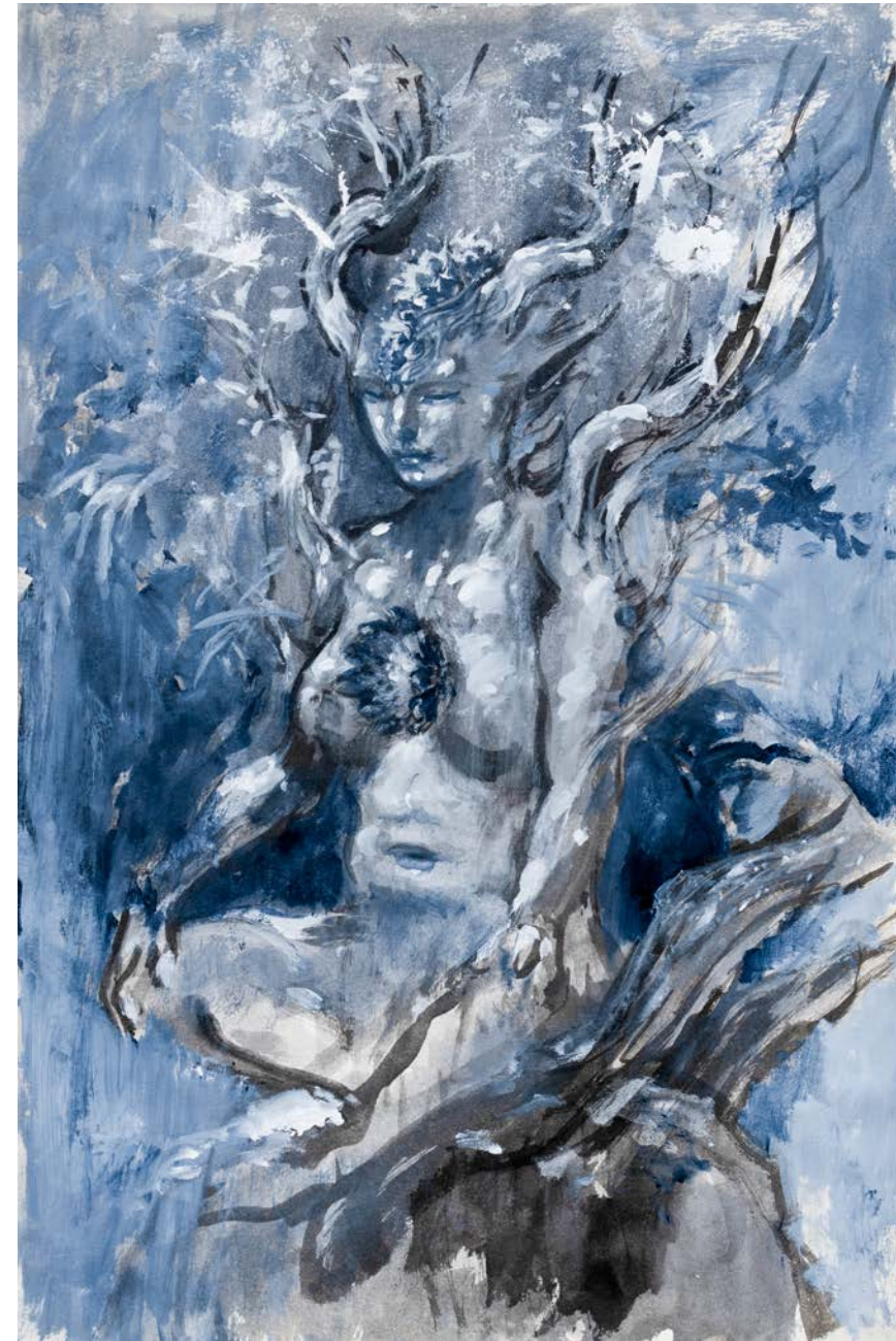
2327 Untitled , 2022 Ink & acrylic on paper, 11 x 16 inch