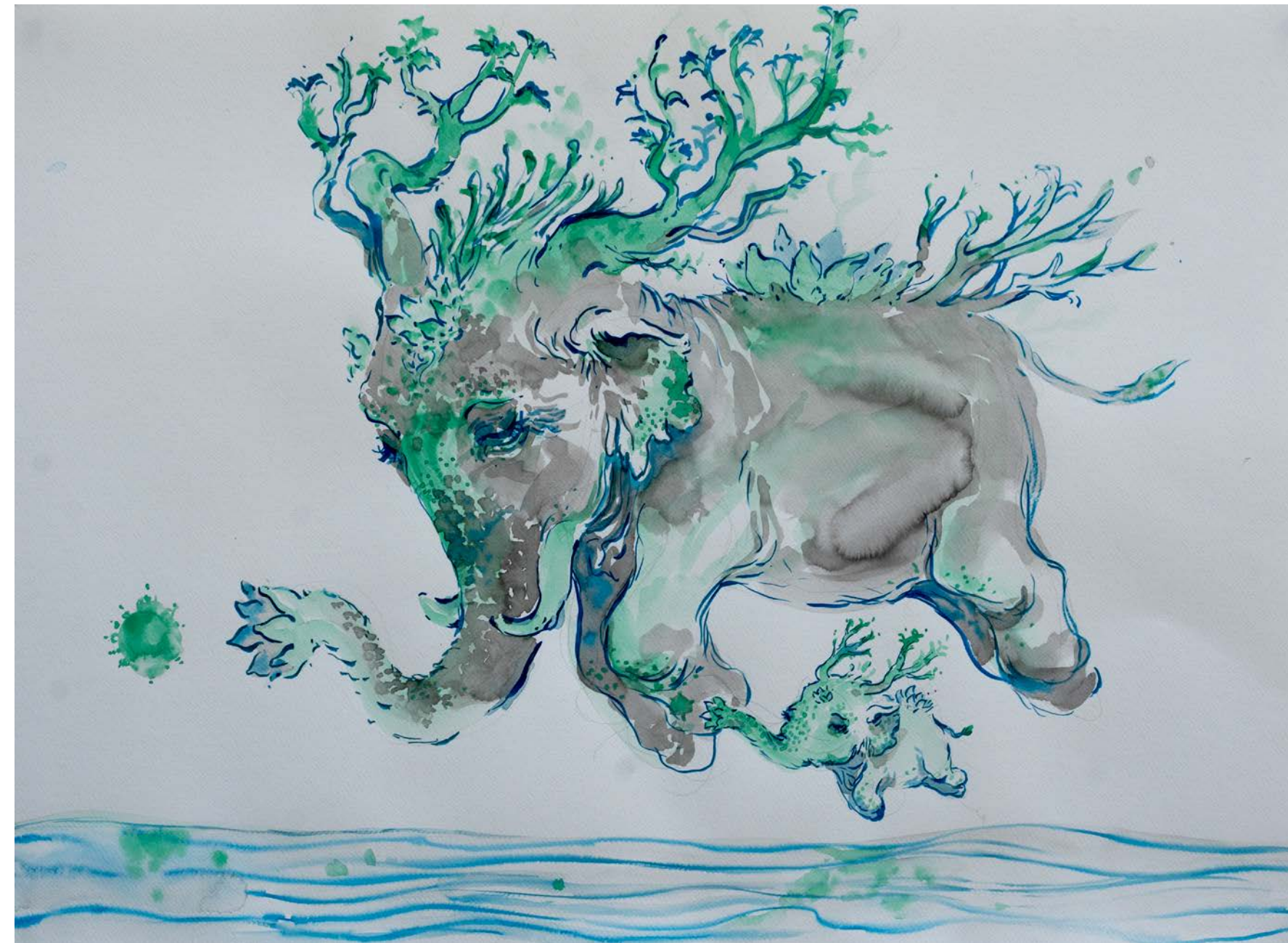
2324 You're not alone , 2022 Ink & Gouache on paper, 22 x 30 inch