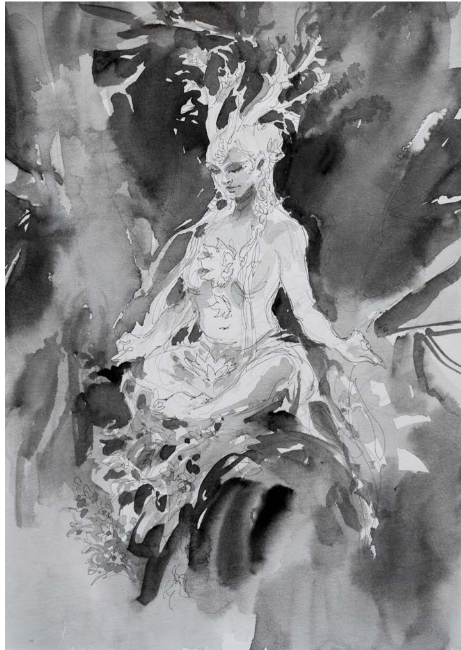
2330 Untitled , 2022 Ink on paper, 11 x 16 inch