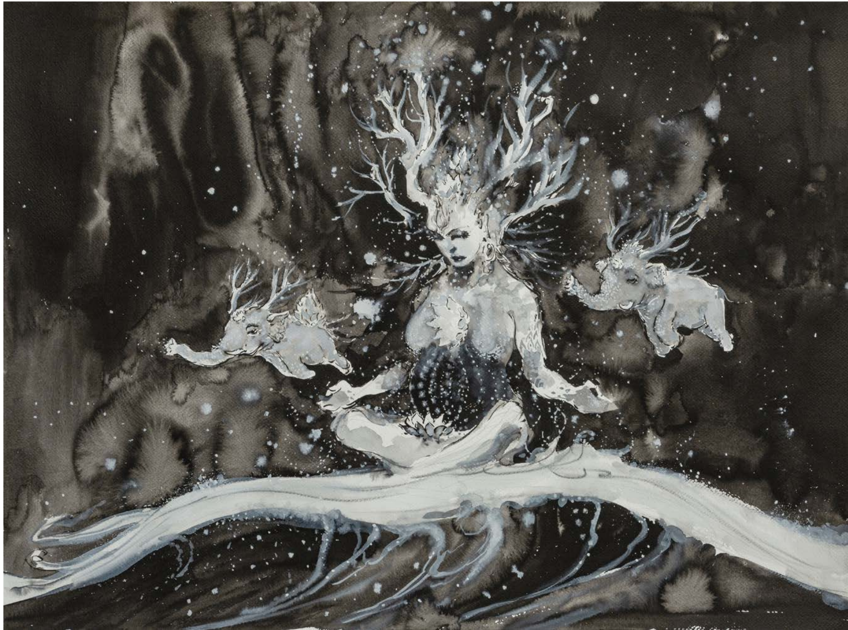
2313 Star womb , 2022 Ink & Gouache on paper, 22 x 30 inch