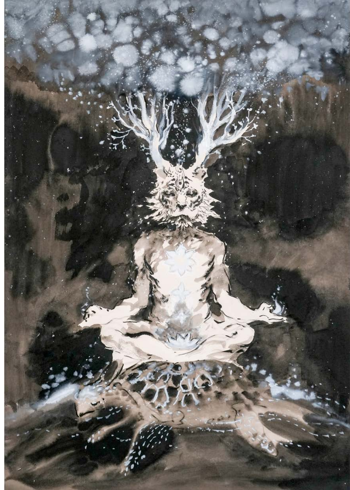
The Phylogenetic Dream Tree , 2022 Ink & Gouache on paper 19 x 28 inch