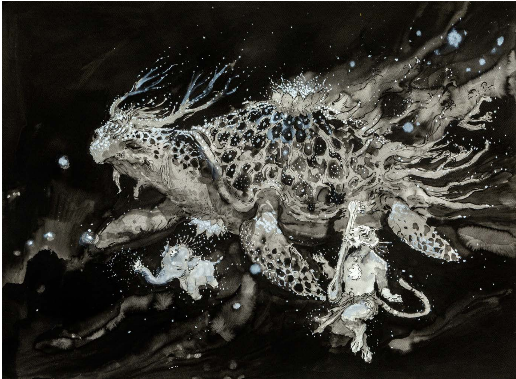
2303 Songs of Turiyam , 2022 Ink & Gouache on paper, 22 x 30 inch