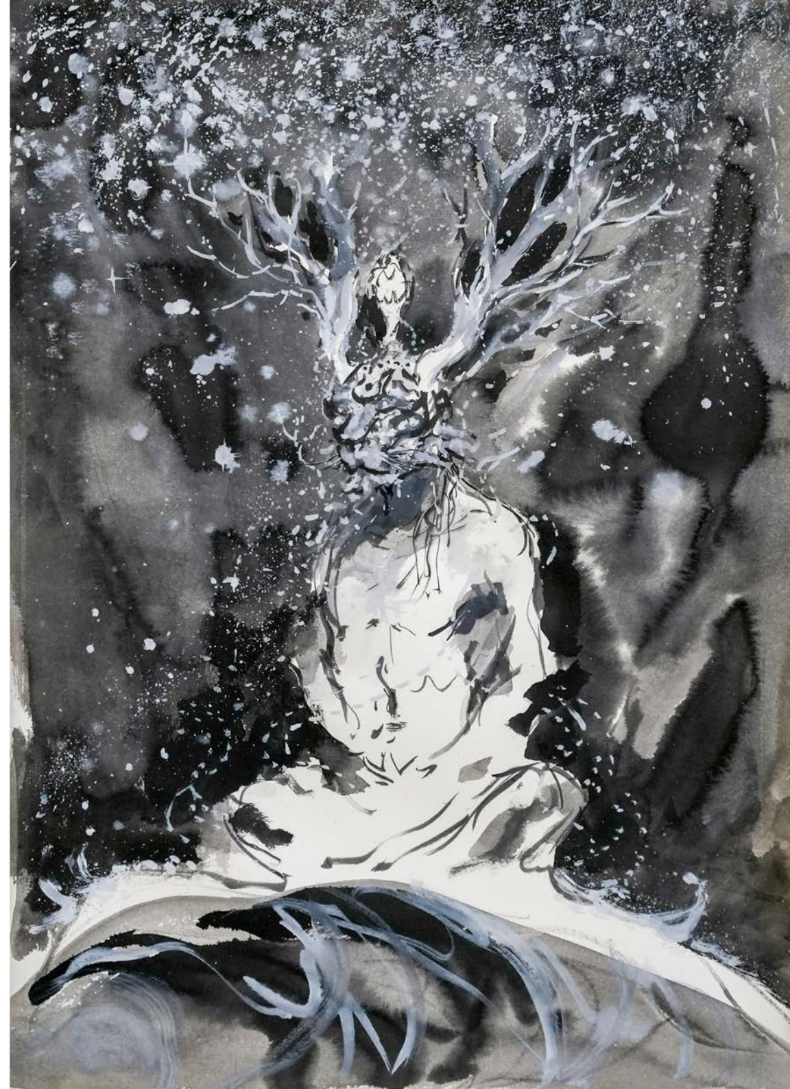
The Pranic , 2022 Ink & Gouache on paper 12 x 16 inch