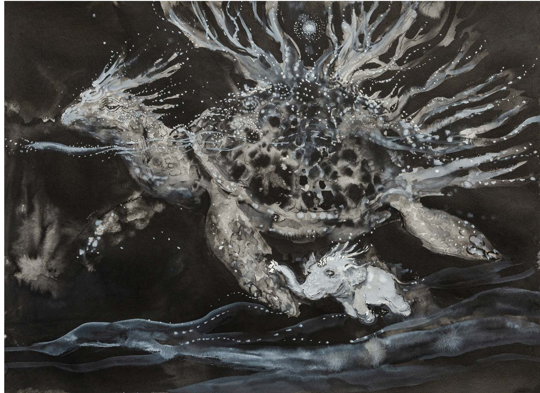
2315 The great pranic Mother , 2022 Ink & Gouache on paper, 22 x 30 inch